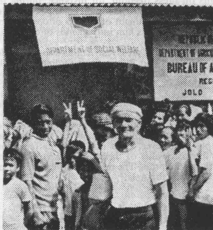
Muslim Refugees: Welfare but not Rights

Embassy of the Philippines, RAUL CH. RABE London, W8. Consul